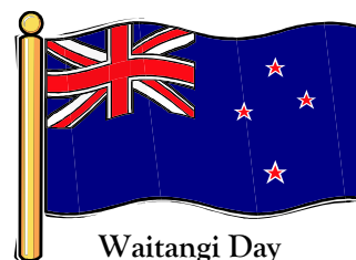
Waitangi Day Sunday 6 February 2011

St Matthew's is a Diocesan School and we look forward to welcoming them to their Cathedral.